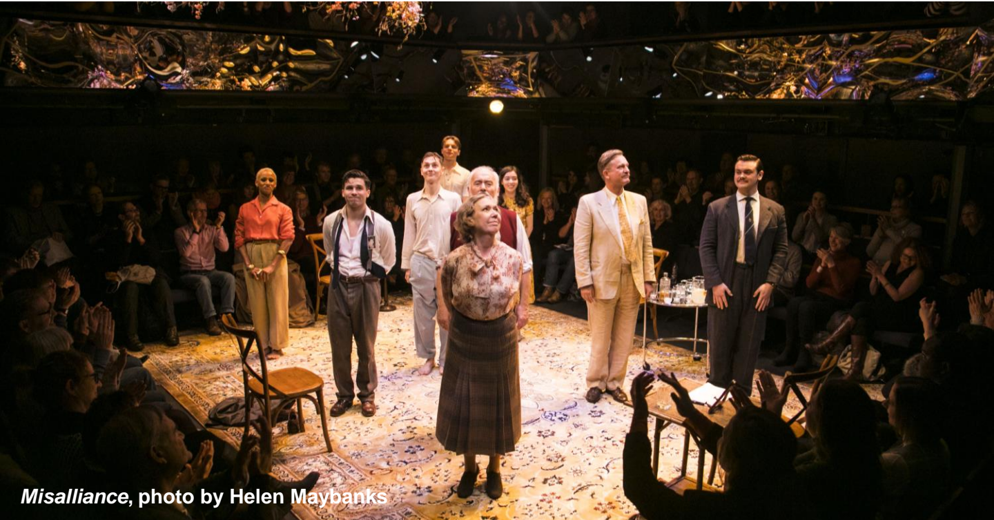
Misalliance