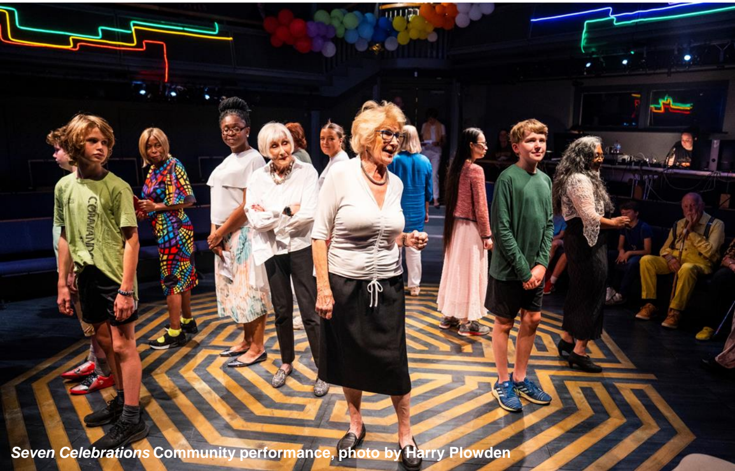
Seven Celebrations Community performance

ORANGE TREE THEATRE LTD | Registered charity number 266128 1 Clarence Street, Richmond, London TW9 2SA | orangetreetheatre.co.uk | 020 8940 0141