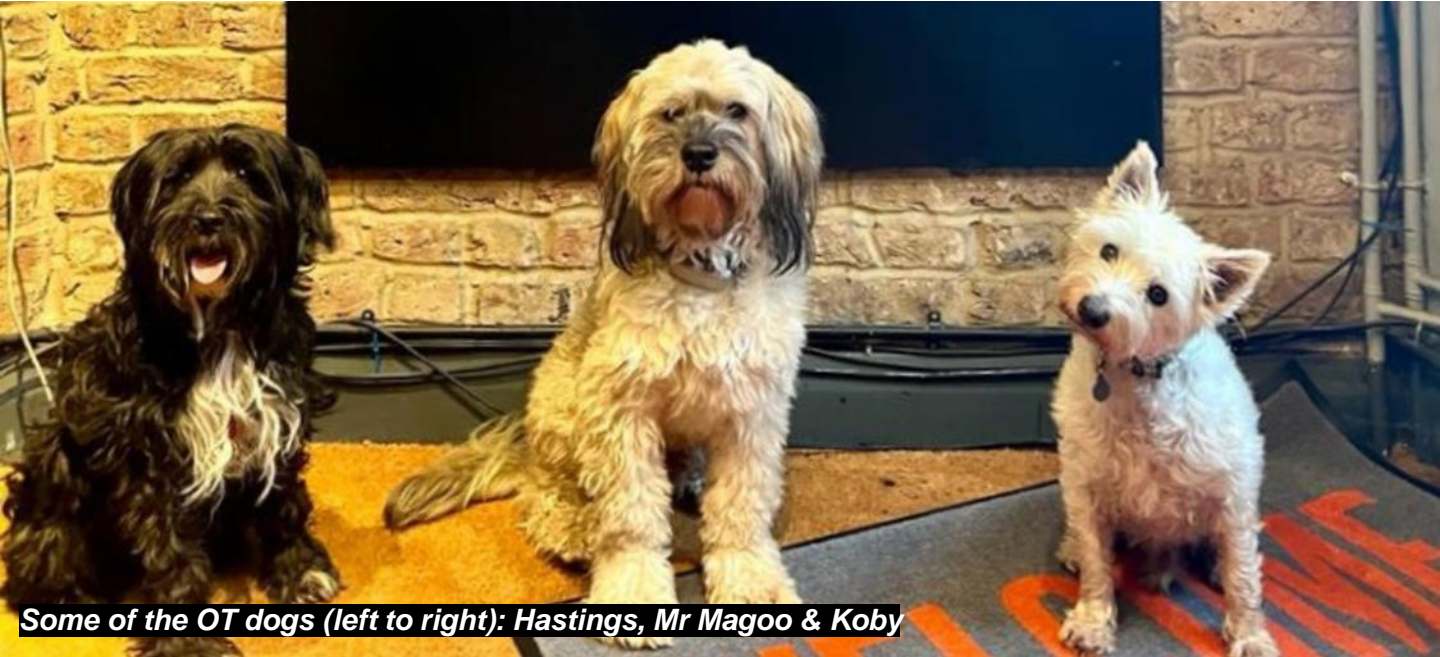
Some of the OT dogs (left to right): Hastings, Mr Magoo & Koby