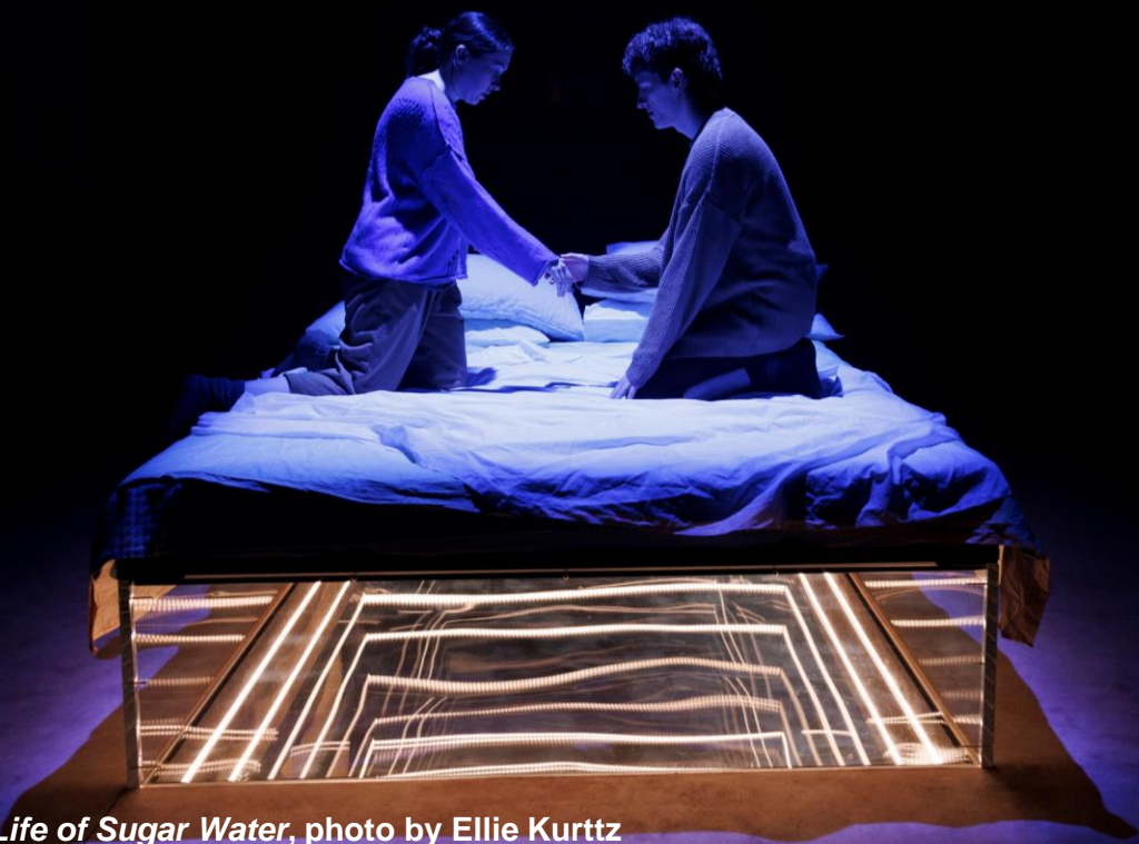
The Solid Life of Sugar Water