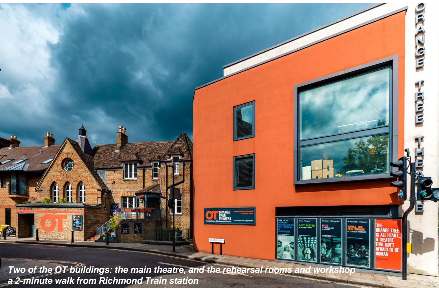
Two of the OT buildings: the main theatre, and the rehearsal rooms and workshop a 2-minute walk from Richmond Train station